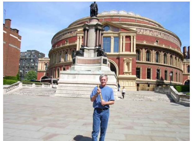
Lurking outside Albert Hall in London