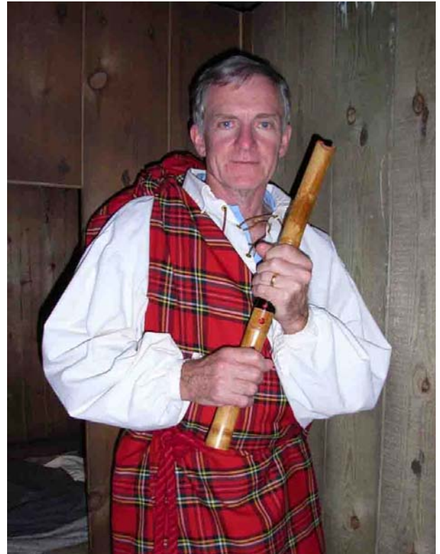
Holding a Bass Shakuchanter .....