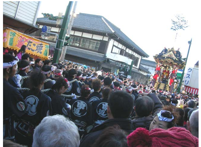
After sake - photographer?